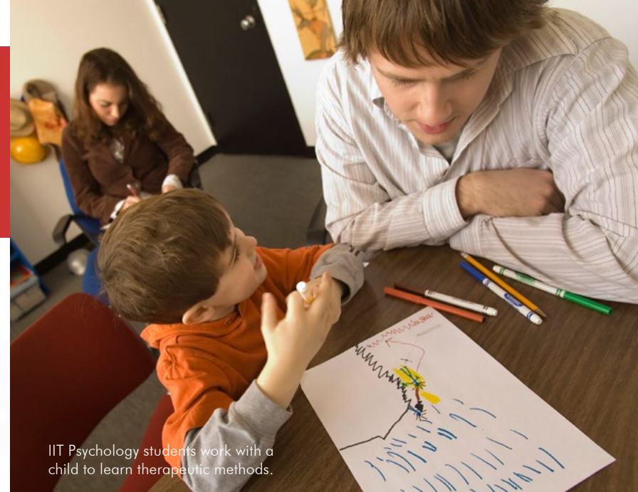
IIT Psychology students work with a child to learn therapeutic methods.

My hypothesis is that the more fun the game is, the more likely participants are to make meaningful lifestyle changes and stick with those changes for the long haul.