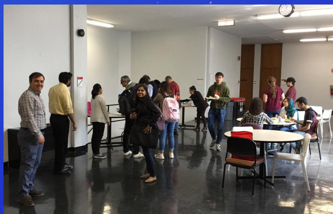
March 2019 Lunch with Professors & GSA Elections