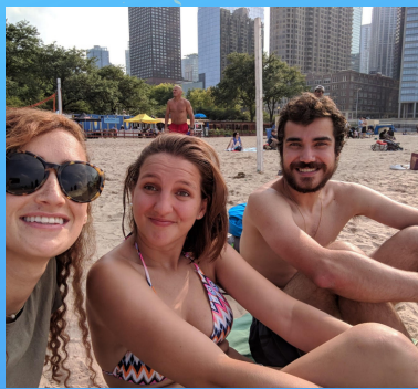
Aug 2018 - Chilling at North Avenue Beach