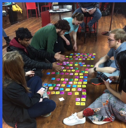
March 2019 - Pielympics with AIChE