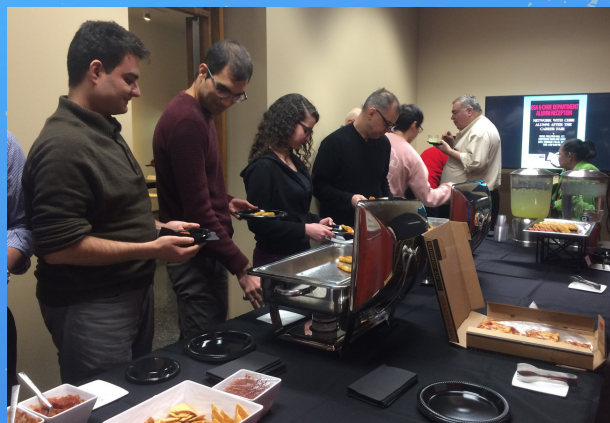
February 2019 - GSA & ChBE Alumni Reception