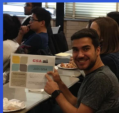
Fall 2018 - GSA Lunch Talk