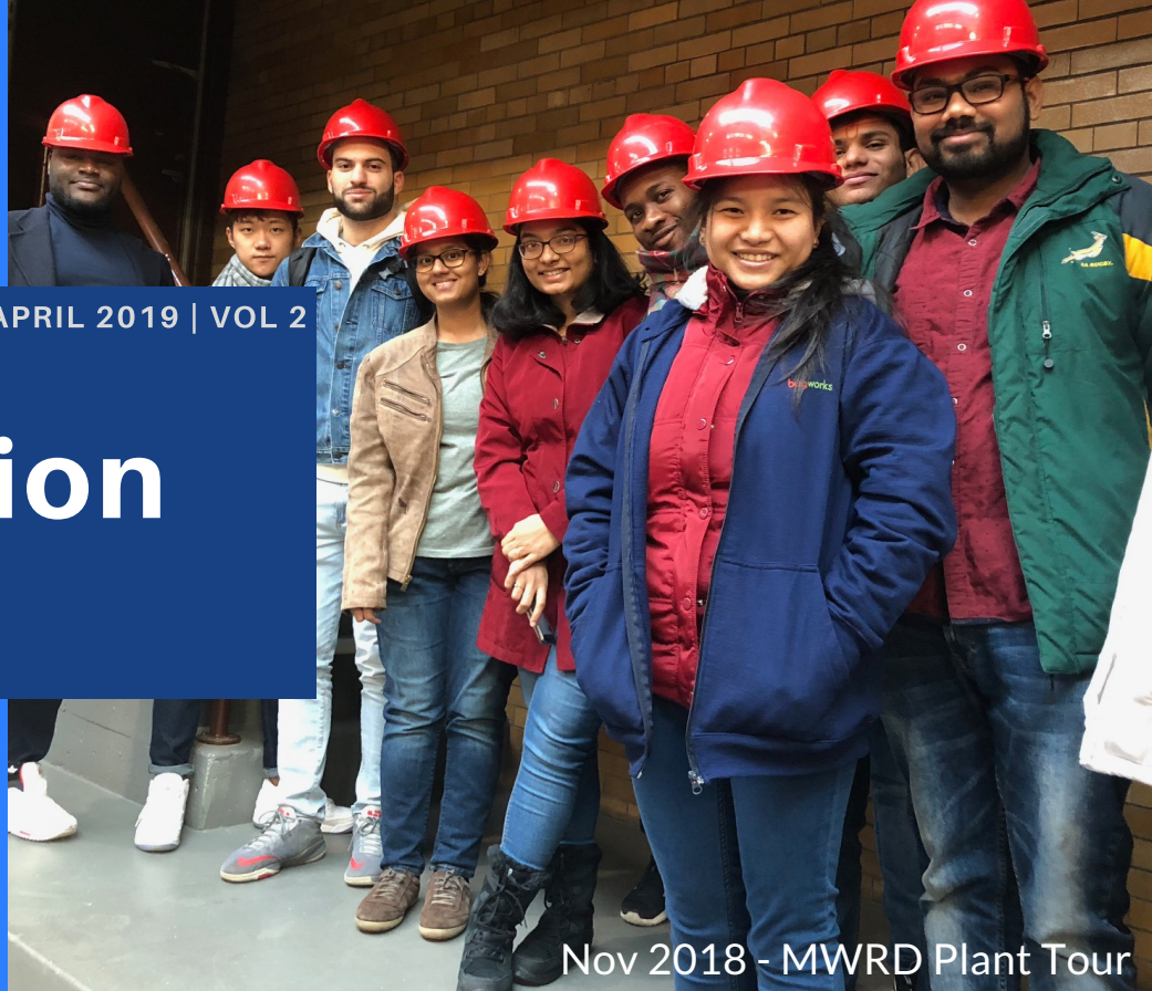
Nov 2018 - MWRD Plant Tour