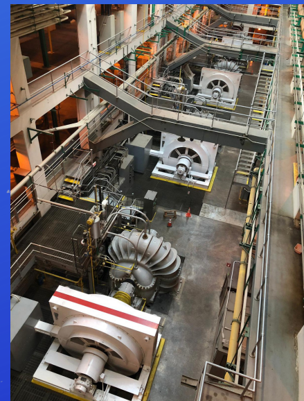
November 2018 - Plant Tour