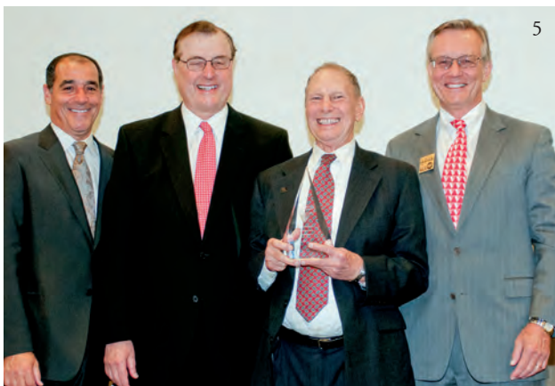
1: Winners and guests took part in the 66th annual Alumni Awards luncheon.