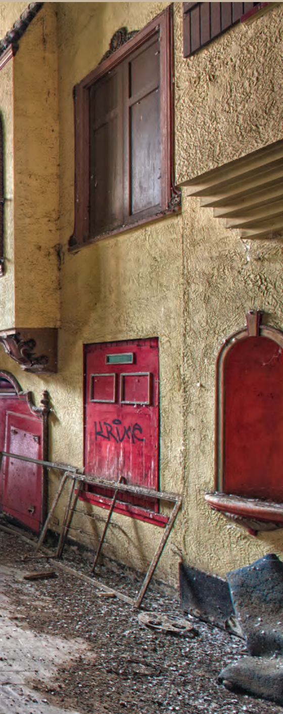
Inside the Ramova, built in 1929

Bridgeport's Ramova Theatre is an "atmospheric-style" theater, designed to remind moviegoers of a Spanish courtyard on a clear, star-filled night. But the theater closed in 1986 after a 57-year run, and now its dilapidated balconies and few remaining seats more closely resemble a ghost town from a Clint Eastwood western.